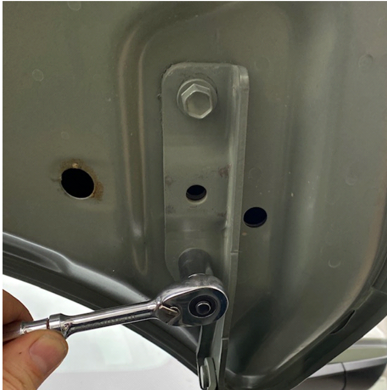
Step 2. Place washers between ditch light bracket and hood hinge.